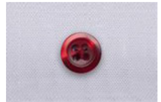
Super Durable Red