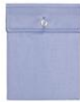
Square With Flap