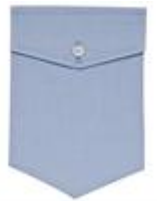
Standard With Flap