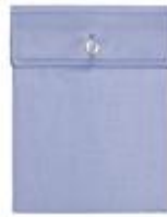
Square With Flap