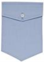
Standard With Flap