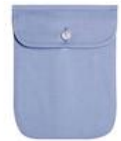
Round With Flap