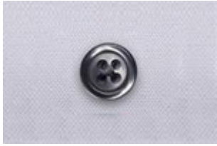
Super Durable Smoke