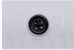
Super Durable Black