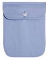
Round With Flap