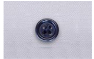
Super Durable Navy