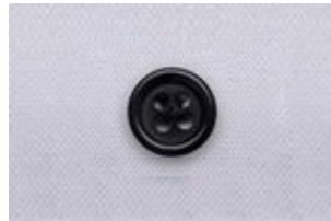
Super Durable Black