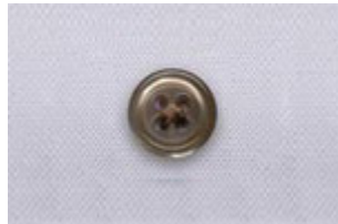
Super Durable Tan