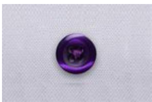
Super Durable Purple