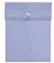
Square With Flap