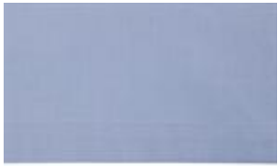
Half Sleeve Plain